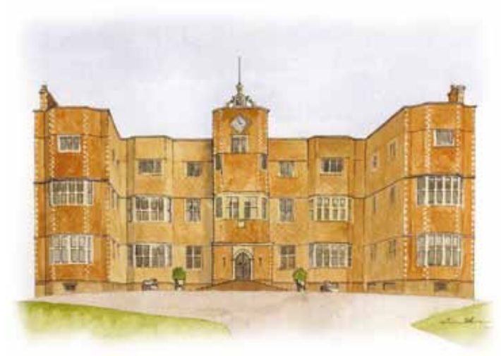
Illustrations by Avery Illustrations.

As you descend back to the village you can clearly see the ridge-and-furrow pattern left by medieval ploughing methods. The up and down ploughing of long narrow strips, with a certain type of plough, threw the soil towards the centre of the strip, so producing a high ridge. Much ridge-and-furrow disappeared with the intense ploughing during the Second World War, however a good deal remains in Leicestershire.