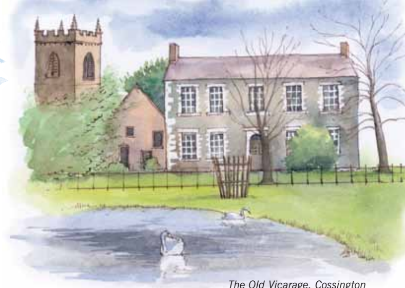
The Old Vicarage, Cossington

Follow directions for Walk 1 until point (2). At the cricket club follow Mill Lane to Sileby Mill and Marina. The marina is an important centre for boating on the Grand Union Canal.