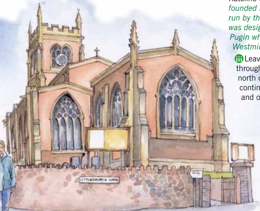
St. Mary's Church, Sileby

Toilets: in the car park behind Tesco's.