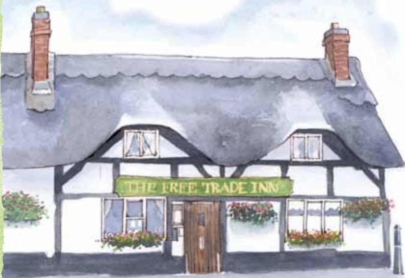
The Free Trade Inn, Cossington Rd, Sileby

The old village pound, now a "Peace Garden", can be found on the left hidden away just before reaching the road. Turn right and walk as far as Herrick Close before crossing to the "High Bridge footpath" opposite, passing the pretty little cottages to the railway footbridge. Continue to King Street.