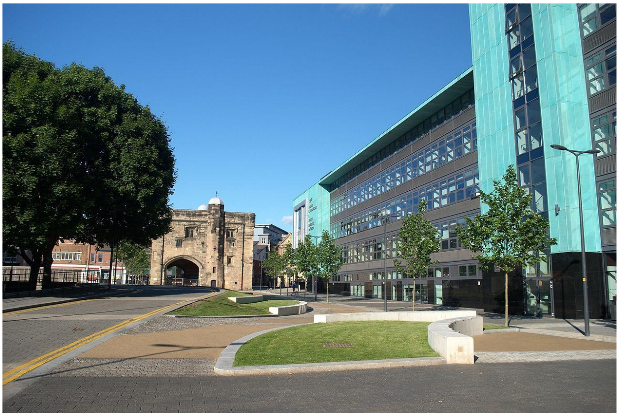
De Montfort University, Magazine Square, with the Hugh Aston Building and the medieval Magazine Gateway. The latter is now unfortunately situated next to a very busy thoroughfare.

The campus lies near to Leicester Castle in a precinct built by the Earls and Dukes of Lancaster, known as The Newarke , whose name survives. The area includes the Newarke Gateway. Listed buildings include Trinity House (rebuilt 1901) which contains part of the 14 th century Hospital of the Annunciation. The Hawthorn Building contains the ruins of the Church of the Annunciation of Our Lady of the Newarke (1353). Richard III's remains were reportedly displayed here before being buried at Greyfriars. The De Montfort University Heritage Centre , opened in 2015, features these ruins.