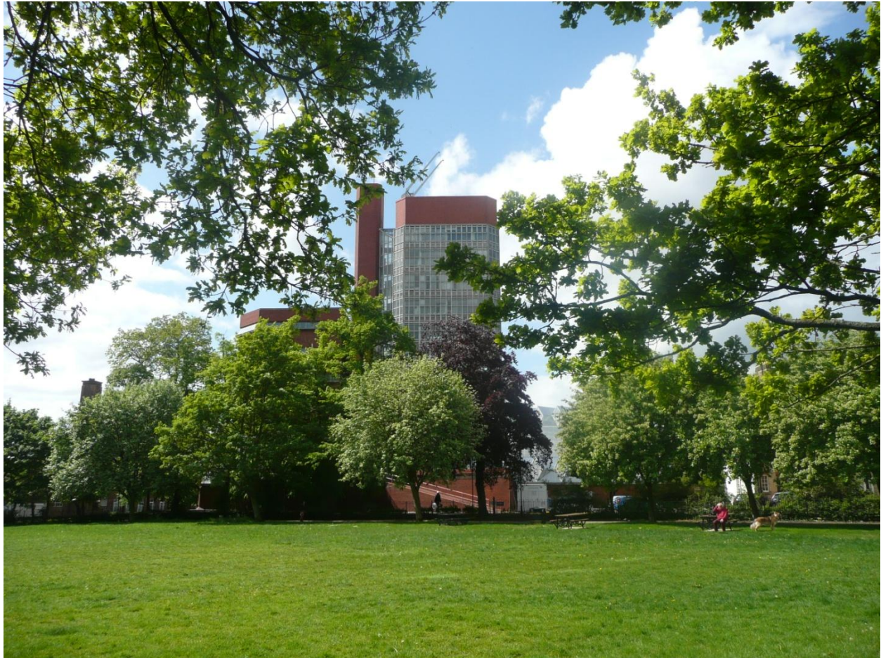
University of Leicester: The Engineering Building (James Stirling, 1963) from Victoria Park. The building can be viewed from within the University campus in the context of its surroundings.