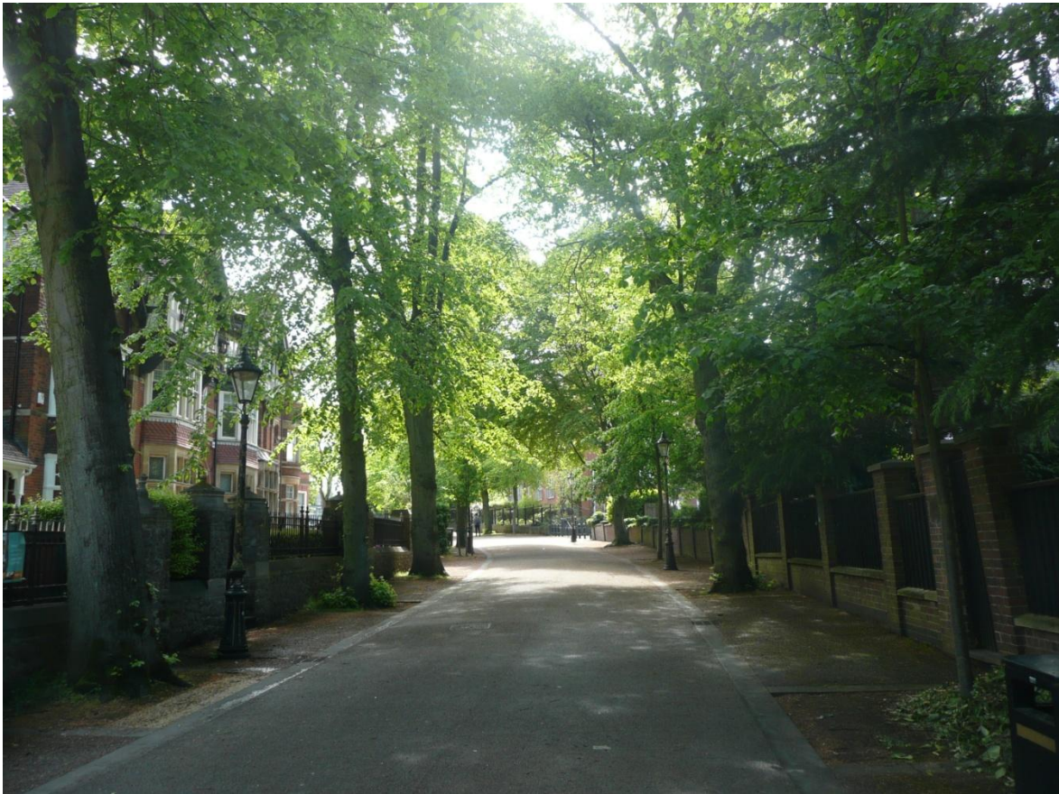
One of Leicester's prized areas: New Walk, looking south back down our route.

...New Walk remains a traffic-free public walk. It is c. 10m wide and tree lined, while the private houses and other buildings which line it are set back, according to the Corporation ordinances of 1824, by at least 9m and have no vehicular access off it. Many, particularly north-west of De Montford Square, are listed. Along the south side of New Walk are three open spaces: Museum Square, which contains the Museum (listed grade II), a large neo-classical building with pedimented portico, opened in 1849 in what had been built in 1836 to a design by J. A. Hansom as a Nonconformist Proprietary School; the much larger De Montfort Square, grassed, and with a statue (listed grade II) of 1870 of Robert Hall (d. 1831), Baptist preacher, advocate of press freedom and supporter of Joseph Priestly, by J. Birnie Philip; and the railed Oval, grass with some specimen trees. Public buildings along the Walk include the Roman Catholic Chapel (Joseph Ireland 1817-19) and St. Stephen's church (A. R. G. Fenning 1893). There is much cast-iron street furniture along the New Walk, notably lamp standards and arches supporting a central light. It is of a pattern seen in Paris in 1895 by Alderman Faire. Whether any of the original ironwork remains is unknown; lights of the same pattern were installed in the 1960s, and the whole of the south side of the walk was lit with columns of the same pattern imported from France in the 1990s.