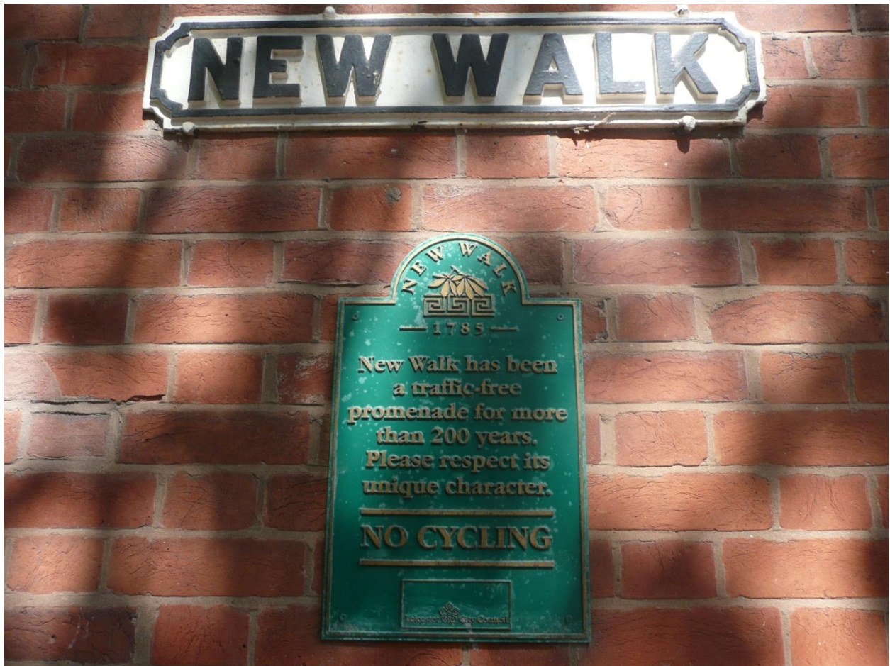
Plaque in New Walk just before Welford Place, which has proved to be too unobtrusive for some cyclists!