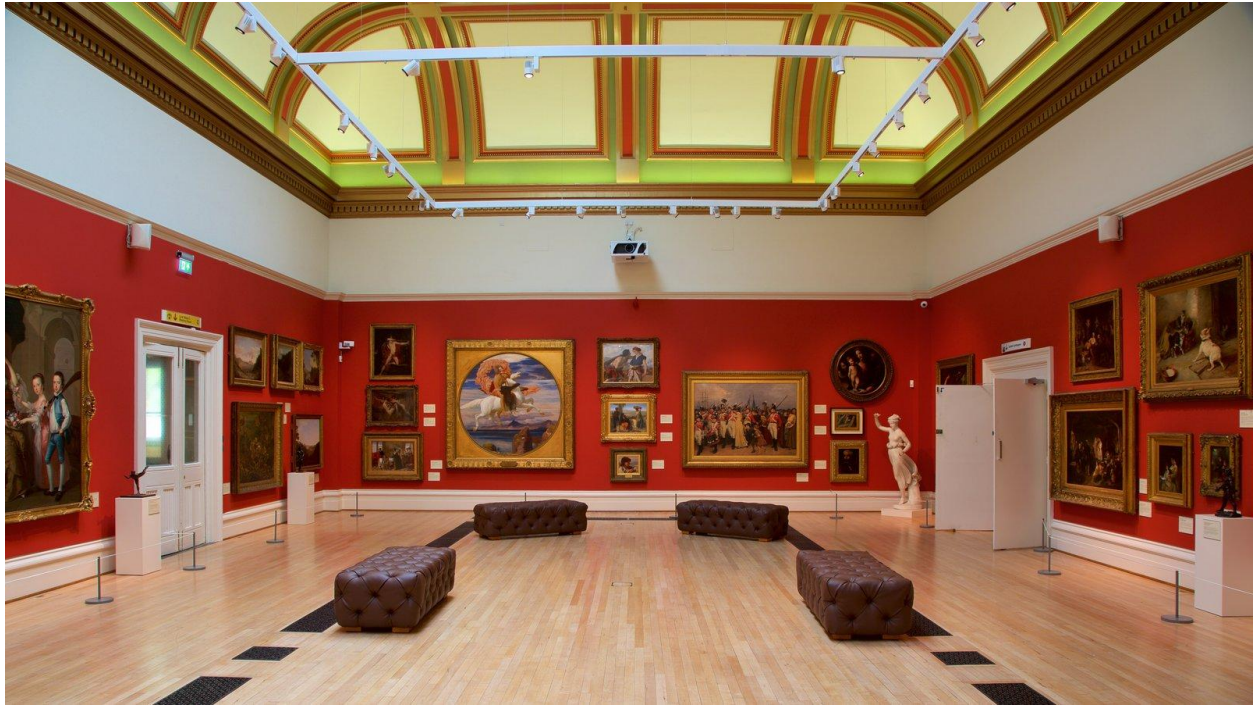
Leicester Museum and Art Gallery. This space doubles for the chamber and instrumental music concerts. (View is from the stage, without concert seating.)