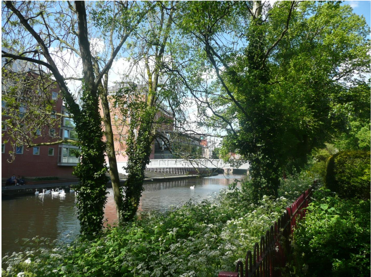
Castle Gardens, showing the bridge you must cross to find the Great Central Way . See previous photograph.