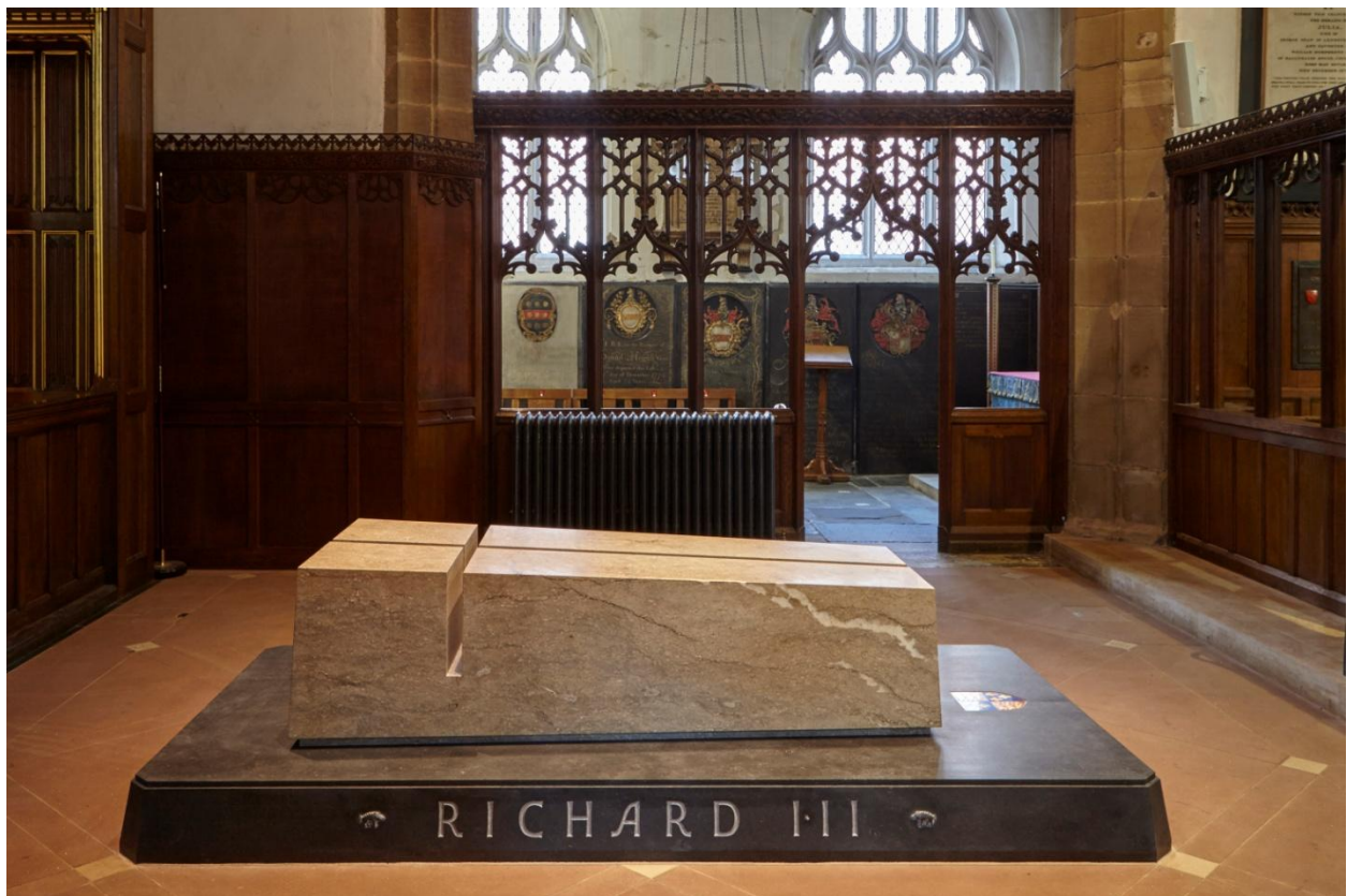
Leicester Cathedral: the reburial tomb of Richard III. This is made from Swaledale fossil stone, quarried in North Yorkshire, standing on a marble plinth suitable for inscriptions. The coat of arms is made of marble and semi-precious stones.

The Cathedral is the site of Richard III's reburial (see below). Though the building is not on the scale of the great English Cathedrals it frames an attractive space, and Richard's simple monument is tastefully designed. Readers of the Leicestershire and Rutland (1960) volume of The Buildings of England will note that the nearby church of St. Mary de Castro, in Castle Yard (which can be visited as part of the walk through this part of Leicester to the Great Central Way – see R3T: PDF A, Leicester Section ,) receives more attention as far as architectural merit is concerned. In fact, until 1927 the Cathedral was the parish church of St. Martin. Externally the aspect is Victorian; the tower and spire (1861 and 1867) ape Early English manners (Pevsner: 'the detail is all correct'). Inside there are older remnants, including a displaced Norman frieze, but the entire effect is composite, as in so many churches the Victorians adapted to their own signatures.