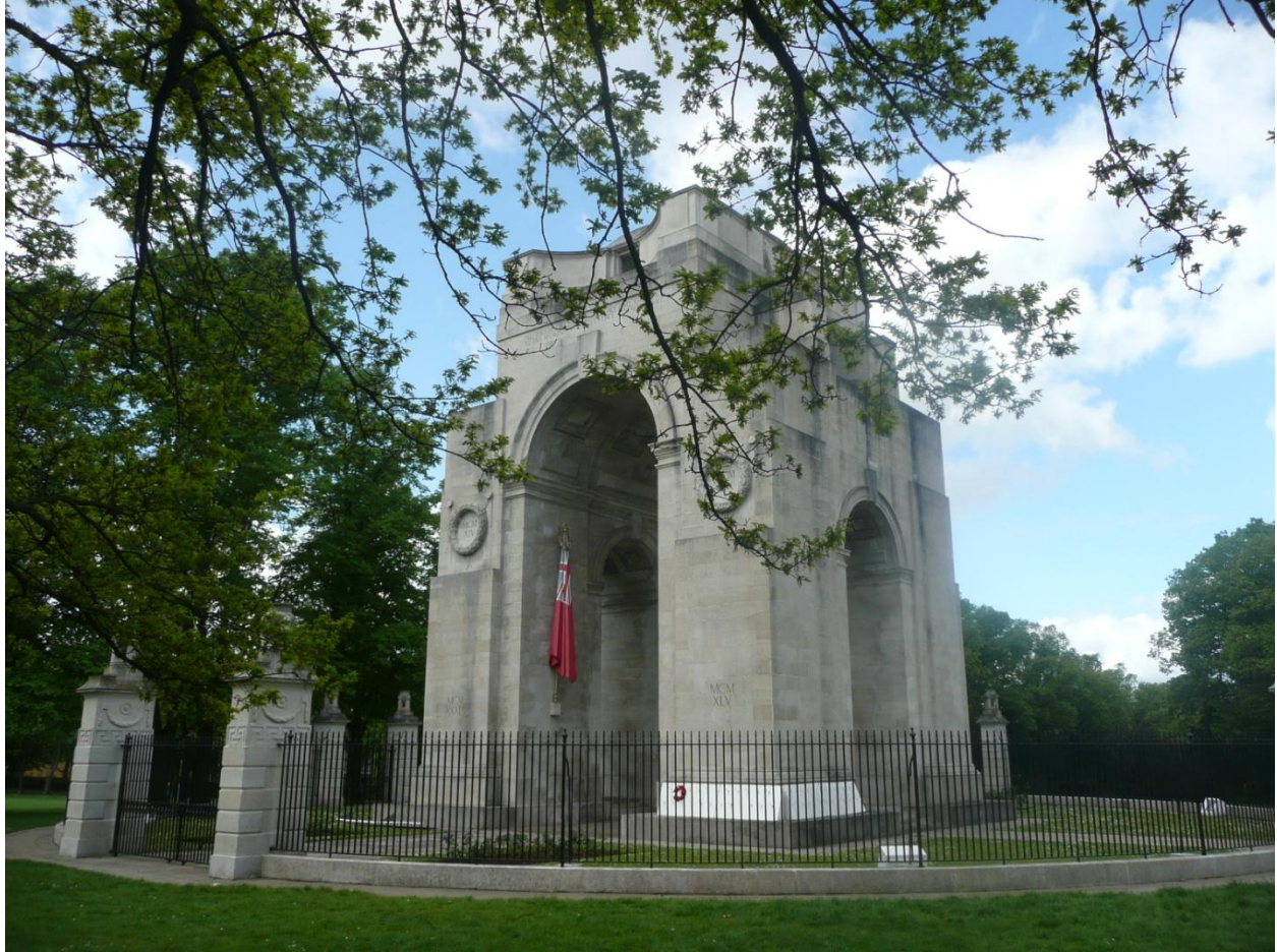
Sir Edwin Lutyens: Memorial Arch, Victoria Park.