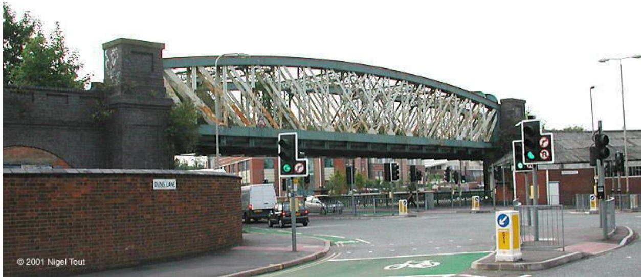
The impressive Braunston Gate Bowstring Bridge, demolished in 2009.