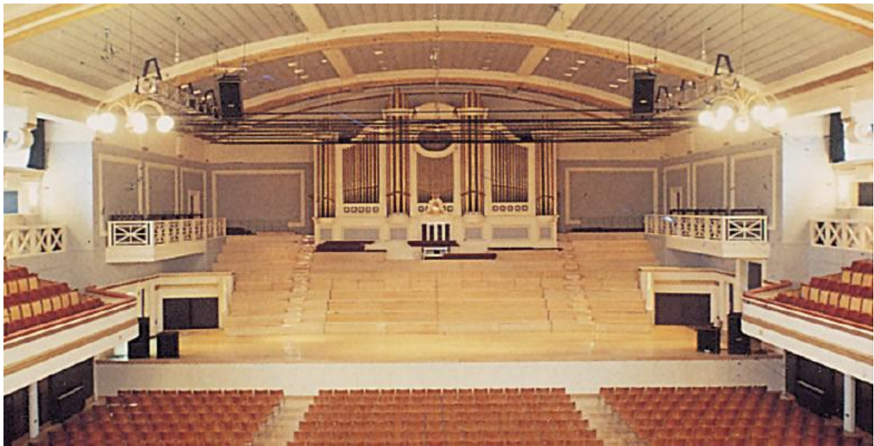
De Montfort Hall, Leicester. Exterior and interior views, the latter showing the stage and historic pipe organ.