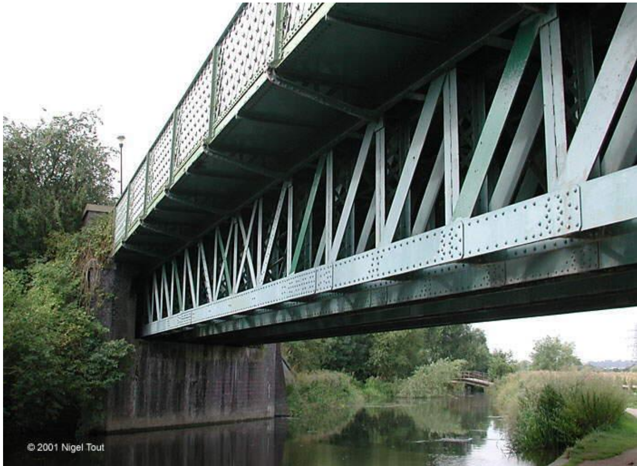
The Great Central Way is atop this fine bridge over the Grand Union Canal in Aylestone Meadows. Reproduced by permission.