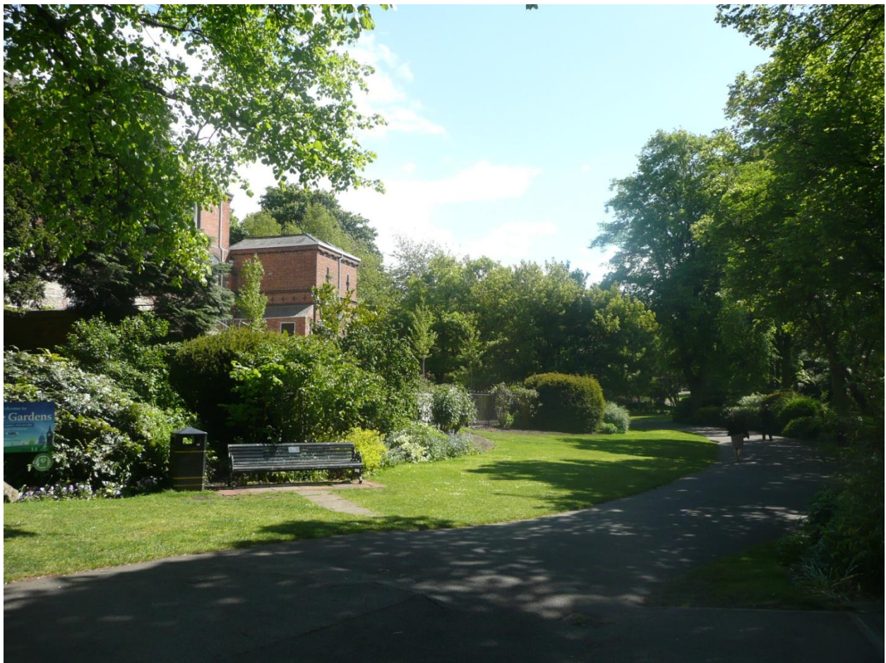
Leicester Castle Gardens, looking back down the route.

The Gardens are an attractive place to pause before moving on to the Great Central Way .