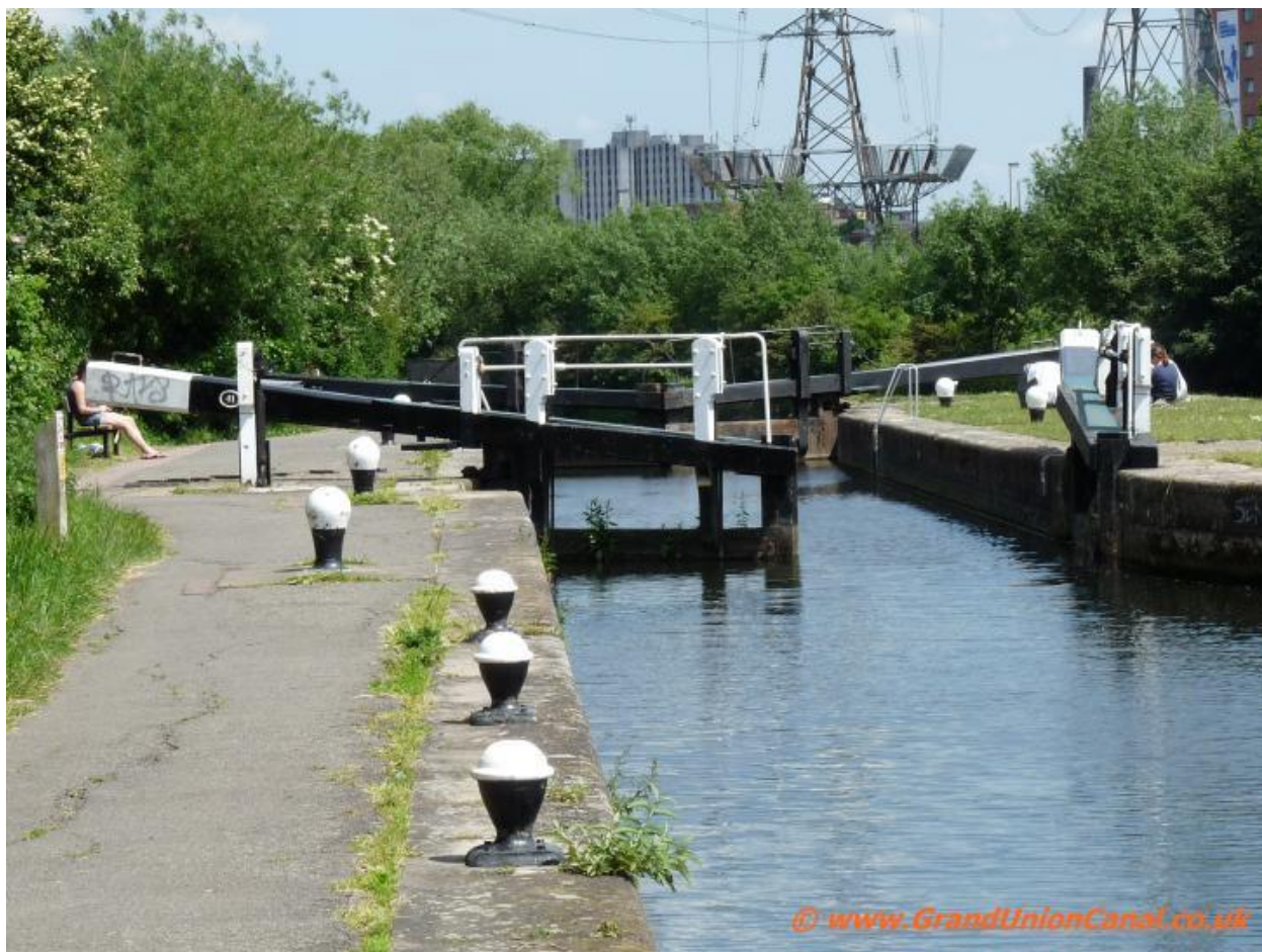
A view of the Grand Union Canal at Freeman's Lock, demonstrating an 'edgelands' profile. (See text below, under 'Narborough'.) Reproduced by permission.