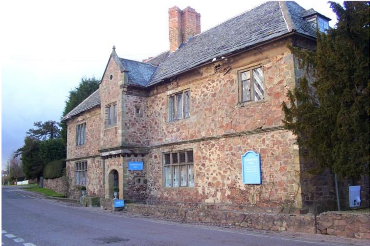
Narborough Hall, Coventry Road.