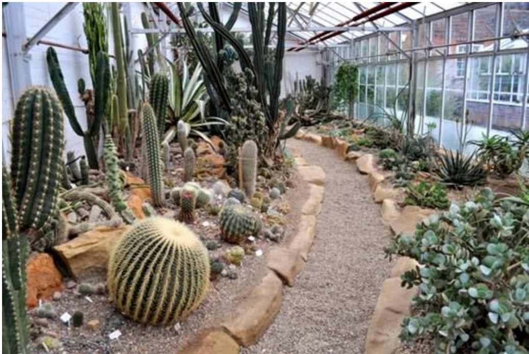
Leicester Botanic Gardens.