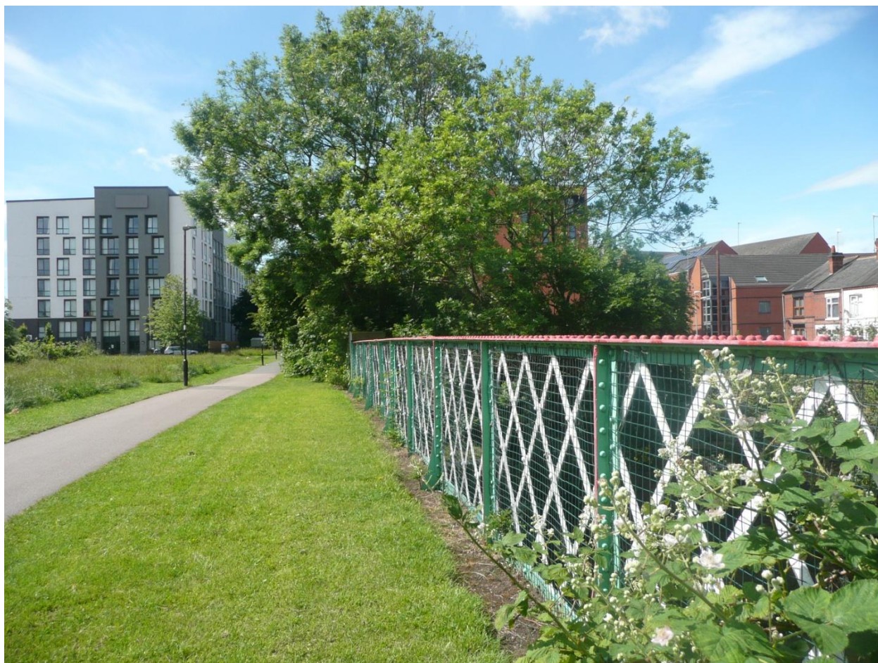
Part of the Great Central Way , with one of the bridge structures still intact and maintained.

documents for our Trail . As our main directions make clear, it is possible to walk part of the route to Narborough along the Grand Union Canal towpath, or adjoining sections of the River Soar, at walkers' own initiatives. (See maps for possible routes.)