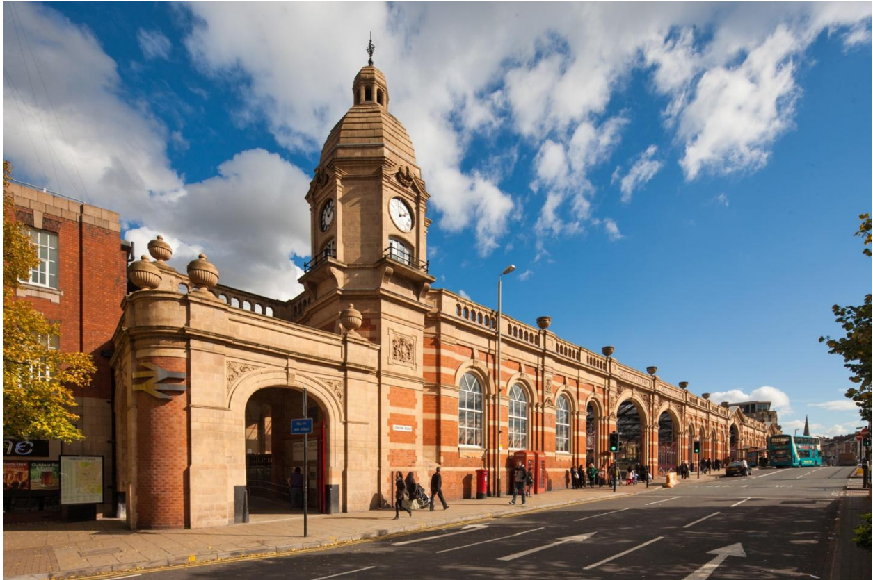
Leicester London Road Station frontage.

Leicester London Road Station can be found by turning right just before the Museum – London Road runs parallel to New Walk. The station opened in 1840, and is the only main line station remaining in the city (the line terminates at London St. Pancras), following closures in the 1960s of the Great Central Station (see The Great Central Way above) and Belgrave Road Station, serving routes to the east – the latter’s booking hall is now the site of an overpass. The platform buildings and the interior of the booking hall of London Road were replaced in 1978, but thankfully the entrance structure has survived. It was designed by Charles Trubshaw as part of a re-building of the original Campbell Street station between 1892 and 1894.