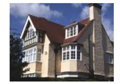
11. 9 Toller Road