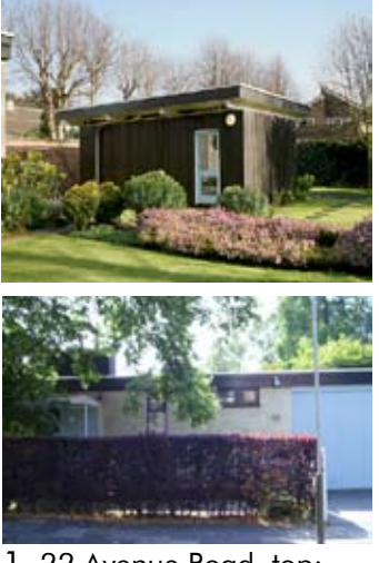
1. 22 Avenue Road, top:

2 Turn right to the junction with London Road and look at the building on the left hand corner, number 1 Avenue Road. This is a fine example of the Tudor Revival style of house that was very popular in Leicester during the last couple of decades of the 19th century, and a style of which Stoneygate boasts many examples. This particular pair of houses was designed by a local architect, W A Catlow (a member of the Goddard & Paget practice), and was built in 1890. Note its lovely chimneys, bold timber framing with fine carving and the plaque on the Avenue Road elevation. 3Turn right. From here down as far as Southernhay