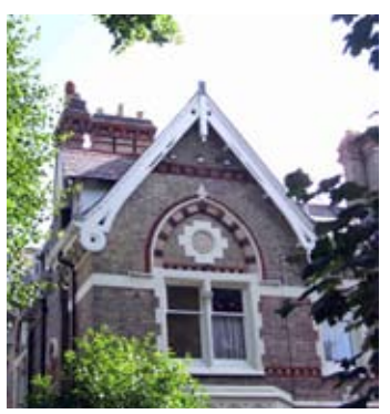
22. Detail of 346 London Road