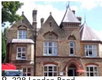
9. 328 London Road