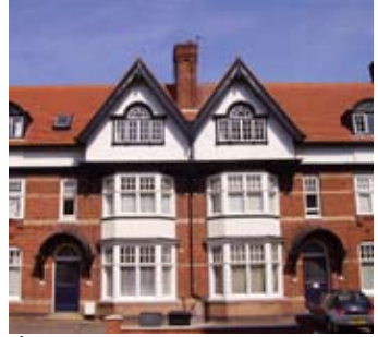
6. 12-18 Stoneygate Road