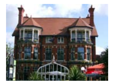
21. The Regency Hotel, 360 London Road

at number 368 London Road by the traffic lights (currently being converted into flats). The high quality materials and decorative interest help them stand out. Cross Knighton Road at the traffic lights and walk on past Stoneygate Baptist Church (1904). This is a good example of the revived Classical style popular in the first quarter of the 20th century - the church is in what is called the Baroque style. O 1 Opposite are 362 London Road and the Z Regency Hotel, 360 London Road. The former is another Goddard & Paget building of 1876, while the latter was once two very large houses, dating from 1902. The one on the right was the home of J. Denzil Jarvis (remember him from Toller Road?) who was one of the unfortunate passengers to be lost at sea in the Titanic disaster (along with 3 other people from Leicestershire). There is a memorial to him in the church yard of St Mary Magdalene, Knighton.