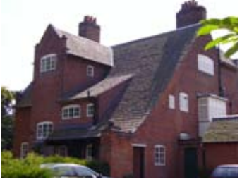
14. Inglewood, Ratcliffe Road