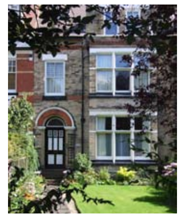
22. 338 London Road

O Finally, have a look at the houses beyond L from 350 London Road back to Sandown Road. Number 350 is Hazeldean and dates from 1880 and has nice Dutch style gables and a recessed porch framed with columns. This is followed by two fabulous terraces of white brick houses that were built in the Gothic style in 1876-7. Their big gables, pierced bargeboards, horizontal red brick banding and architectural details make these some of the most attractive groups of buildings on London Road. Numbers 346-348 have the Leicester Wyvern in Terracotta plaques and were built by Thomas Bland (more of whose houses can be seen round the corner at 2-10 Sandown Road and 1-13 and 2-8 Alexandra Road). 342-344 have great chimneys while at 338-340 stands a handsome pair of buildings from 1890 by Cecil Ogden (who designed the Belvoir Street section of the Grand Hotel in the city centre). You will also note some Scottish house names such as Glenfinnan and Drumashie that reflect the popularity of all things Scottish started by Queen Victoria. Verecroft on the corner of Sandown Road is a 'one-off' from 1870 with big bow windows and a corner turret. Finally, back to point 10 on our map.