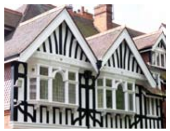
15. Knighton Spinneys, 14 Ratcliffe Road