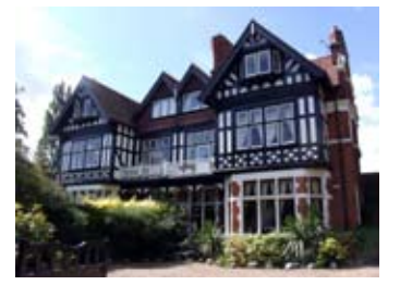
2. 1 Avenue Road and 273 London Road