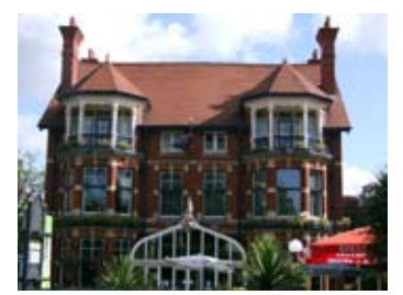
21. The Regency Hotel, 360 London Road

at number 368 London Road by the traffic lights (currently being converted into flats). The high quality materials and decorative interest help them stand out. Cross Knighton Road at the traffic lights and walk on past Stoneygate Baptist Church (1904). This is a good example of the revived Classical style popular in the first quarter of the 20th century - the church is in what is called the Baroque style. O 1 Opposite are 362 London Road and the Z Regency Hotel, 360 London Road. The former is another Goddard & Paget building of 1876, while the latter was once two very large houses, dating from 1902. The one on the right was the home of J. Denzil Jarvis (remember him from Toller Road?) who was one of the unfortunate passengers to be lost at sea in the Titanic disaster (along with 3 other people from Leicestershire). There is a memorial to him in the church yard of St Mary Magdalene, Knighton.