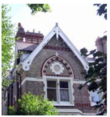
22. Detail of 346 London Road