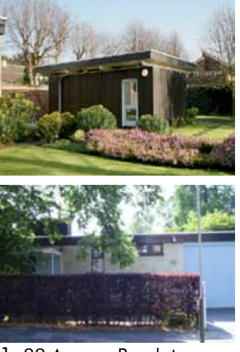
1. 22 Avenue Road, top:

2 Turn right to the junction with London Road and look at the building on the left hand corner, number 1 Avenue Road. This is a fine example of the Tudor Revival style of house that was very popular in Leicester during the last couple of decades of the 19th century, and a style of which Stoneygate boasts many examples. This particular pair of houses was designed by a local architect, W A Catlow (a member of the Goddard & Paget practice), and was built in 1890. Note its lovely chimneys, bold timber framing with fine carving and the plaque on the Avenue Road elevation. 3Turn right. From here down as far as Southernhay