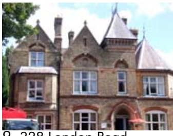
9. 328 London Road