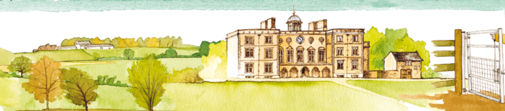
Sir John Moore's Free School