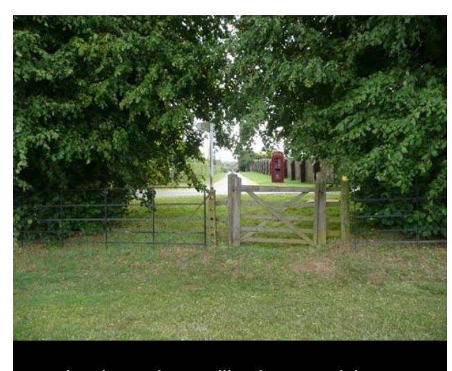
Entering the road at Nevill Holt to turn right

Before reaching the end of this field you will come to a double gate in the hedge with a waymaker. Pass through and now enjoy a walk by the hedgerow on your left for several fields, with gates and waymarkers. (As you proceed, Rockingham Castle will come into view in the distance just a little to your right). You will eventually pass through a gate into a field at the end of which some properties in Great Easton are visible.