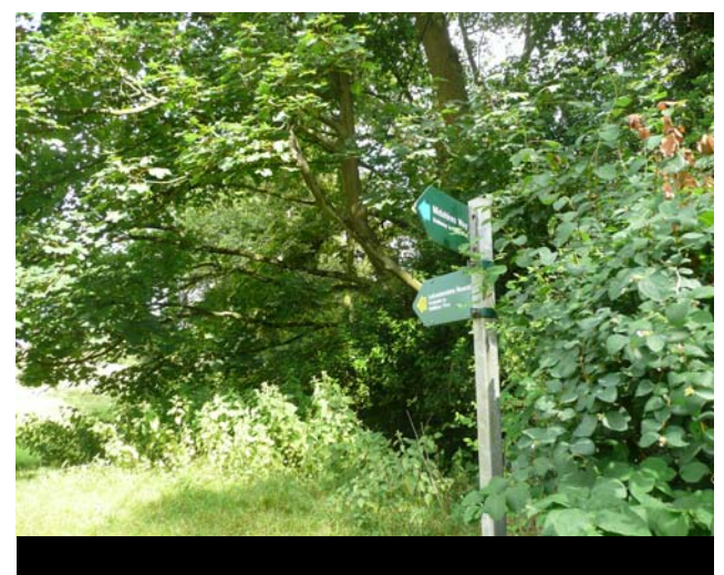
Leicestershire Round & Midshires Way at Cranoe

Carry on down the track to the next waymarker and hold your course to the corner of the wood, along the grassy trail. You will come to another metal gate where you turn left and proceed along the line of the fence (noting Noseley Hall and its nearby church over to your left) before entering the wood.