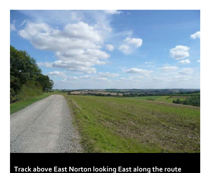
Carry on down the lane until you reach the minor road. Cross the road through the gate with a waymarker and walk ahead keeping

Pass through a gate (or use the stile) at the waymarker and hold your course, still with the hedge and later a fence on your left. Go past the marker stone for the Ordnance Survey trig point and at the next waymarker swing right to keep the hedge on your left. Your exit lies up ahead in the corner of the through gate with а waymarker. Go down the farm track and pass Fearn Farm, where it is sometimes possible to stop for refreshments. (Shortly before the farm will cross buildings you the Leicestershire Round which comes up from Allexton on your left and proceeds to Hallaton past the animal pens on your right).