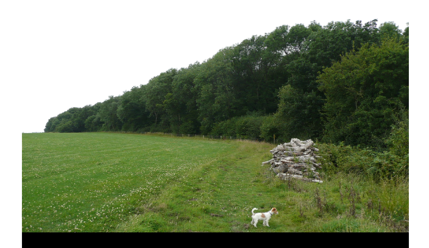
Approaching Launde Wood

You will be able to see Gunthorpe Hall to your right across the fields. Carry on through a metal gate and walk towards the stone building in front of you, passing through another metal gate. Pass the building on either side, and make for the pylon up ahead, joining the paved road coming up on your right. Going over the cattle grid you will find information about Old Hall Farm (the stone building) and Martinsthorpe House. From here your route lies straight ahead over mostly grassy and gravel surfaces until you meet a tarmac road at America Lodge.