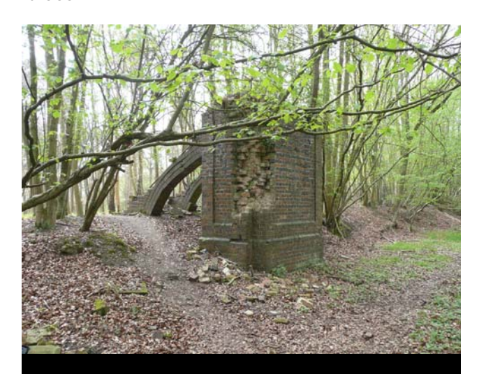
Kings Cliffe Wood – route up the bank

You will reach the wood ahead and enter over a stile. Keep to the meandering path; you will eventually reach the track bed of the old railway line, where you swing right. Almost immediately, and just before what remains of the bridge pillar, turn left up the bank and swing right to proceed through the avenue of trees.