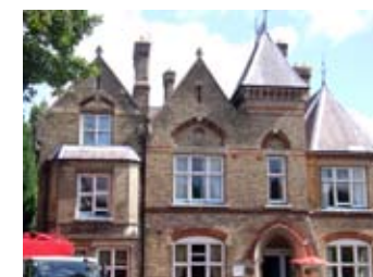
9. 328 London Road