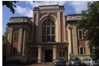
20. Stoneygate Baptist Church, London Road