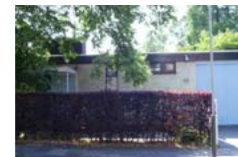
1. 22 Avenue Road, top: