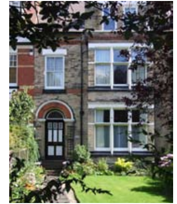
22. 338 London Road

342-344 have great chimneys while at 338-340 stands a handsome pair of buildings from 1890 by Cecil Ogden (who designed the Belvoir Street section of the Grand Hotel in the city centre). You will also note some Scottish house names such as Glenfinnan and Drumashie that reflect the popularity of all things Scottish started by Queen Victoria. Verecroft on the corner of Sandown Road is a ‘one-off’ from 1870 with big bow windows and a corner turret. Finally, back to point 10 on our map.