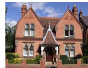
13. 75 Knighton Drive