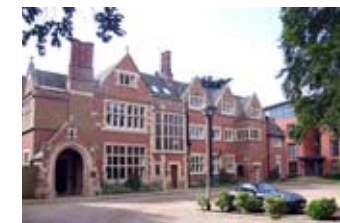
16. Knighton Hayes, 6 Ratcliffe Road