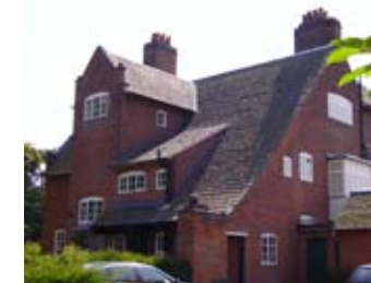
14. Inglewood, Ratcliffe Road