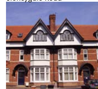
6. 12-18 Stoneygate Road