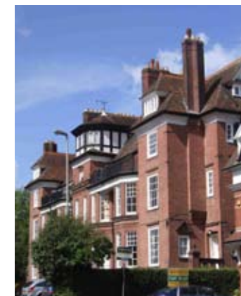
5. De Montfort Court, Stoneygate Road

7 Walk back to London Road and turn left. 322 London Road is Hampton House which dates from 1889. Built in a local brick it is very plain, contrasting strongly with the more ornate Tudor style houses around it. It is much altered inside.