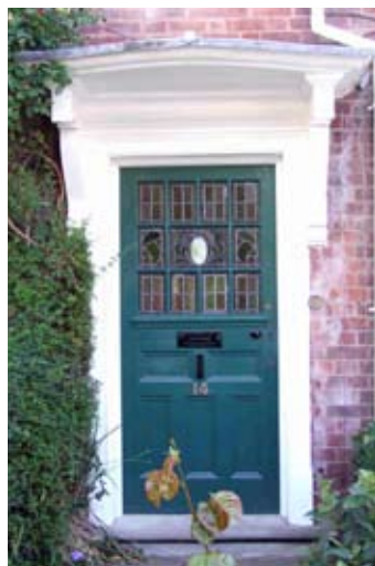
12. Front door to number 14 Stoneygate Avenue