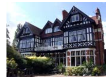
2. 1 Avenue Road and 273 London Road