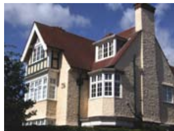
11. 9 Toller Road