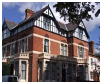
10. 330 London Road and 1 Sandown Road

11 Crossing back over London Road and turn left into Toller Road . This road runs through