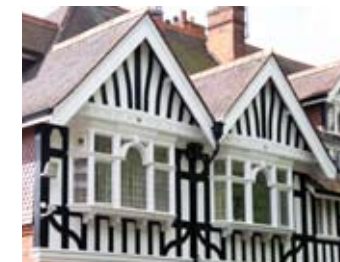
15. Knighton Spinneys, 14 Ratcliffe Road