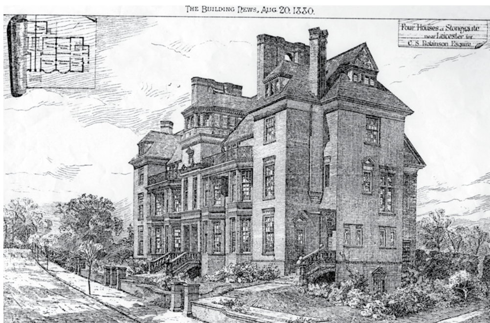
An engraving of the original architect's line drawing of 2-8 Stoneygate Road, (De Montfort Court).