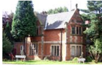
17. 2 Ratcliffe Road

19 Continuing on to Knighton Drive the house on the corner, 337 London Road , is another God-