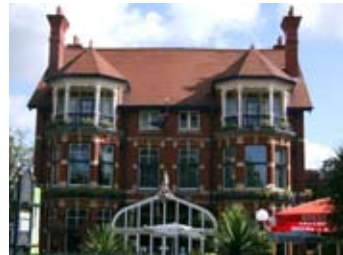
21. The Regency Hotel, 360 London Road

dard design as are the former semi-detached houses at number 368 London Road by the traffic lights (currently being converted into flats). The high quality materials and decorative interest help them stand out.