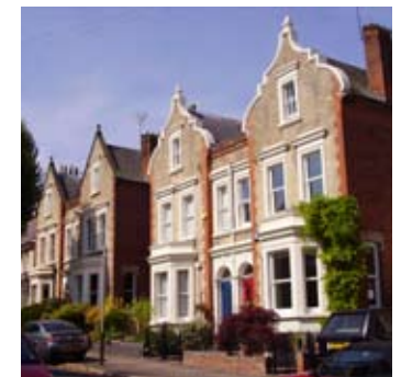
22. Villas along Alexandra Road.