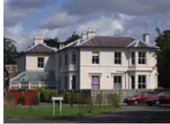
18. Martin House, London Road