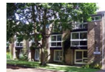
8. Oliver Court, London